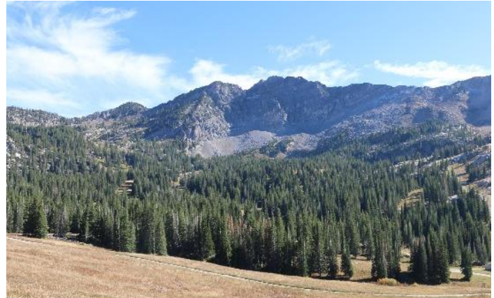
Figure 1: Devils Castle

From field reconnaissance, we noted that the current topography expresses a gully that may have existed, which helped direct the runout, confining it and possibly