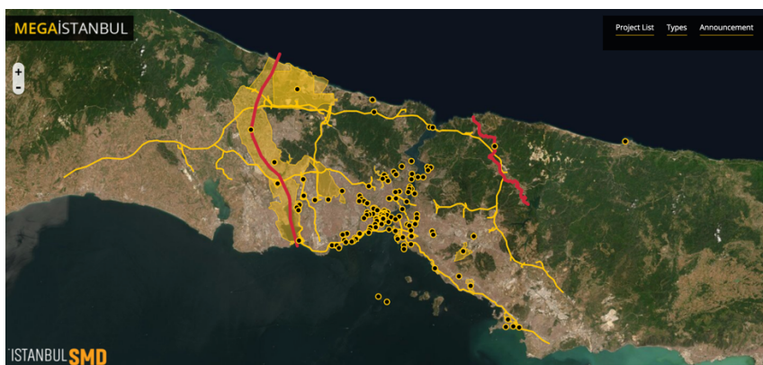
Figure 1. Mega projects pointed in the map of Istanbul (Source: en.megaprojeleristanbul.com , Date: August 2020)

It can be said that the fringe belt formations taken over the aerial image of 1946 are the last photograph in the inner circle belt class of Istanbul. After this period, the city starts to grow rapidly on both sides with the speed of increase in housing production, population growth and migration in the city, developments in planning and new policies. In this period when middle-fringe belt areas were formed, the first and second Bosphorus bridges and highways connected to them became the threshold line in the formation of fringe-belts. Especially sports fields, industrial areas, organized industrial zones, military areas, ports and airport (Atatürk Airport) are the land use types seen in this period. Some of the industrial land-use areas that enter the middle-fringe belt area are in Kartal district on the Anatolian side. On the Anatolian side, industrial formations on the e-5 highway, around İçerenköy, and military field formations between Maltepe and Kartal are also included in this field. In this period, while the slum formation is accelerating, the residential and commercial texture of the city continues to develop with the arrangements such as factor ownership law in the slums and the acceleration of the apartment building process. In this period, which lasted until the 1980s, outer fringe belt generations started to show their first traces.