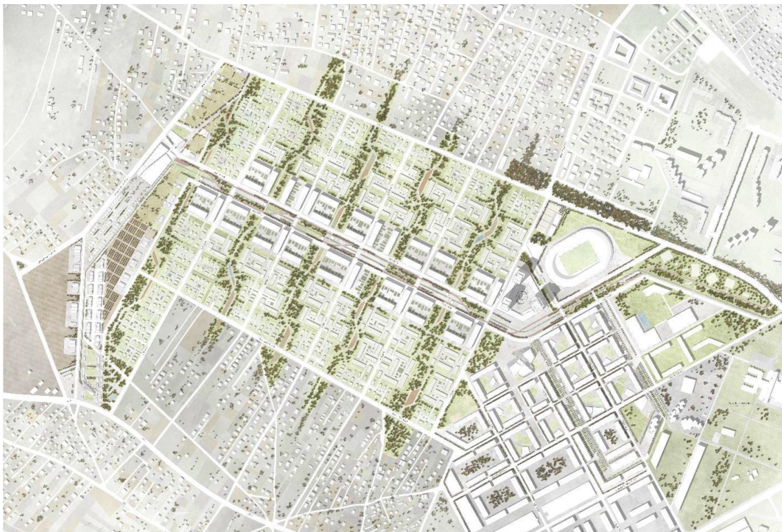
Figure 2. Sadine Masterplan (Image from the Master Degree Thesis "Urban projects for marginal landscapes", by S. Bianchi, S. Corrado, F. Corso, D. Orazi. Thesis supervisor: R. Belibani)

The aim of the call is to promote the densification of the area to create a new urban hub that will lighten the urban load of the center of Podgorica and balance it with the introduction of services and architectures such as to project the city towards a European dimension.